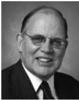
Adam Ingram Minister for Children and Early Years

The publication of this document is not the end of the story. Rather, it is an important milestone in an ongoing partnership that we are determined to build on as we move forward with implementation. We look forward to doing so for the benefit of Scotland's children.